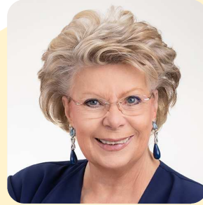
Viviane Reding World Law Foundation VP, European Commission VP (2010-2014) Luxembourg